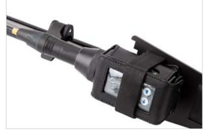
You can move the transmitter plate to the end of the handle, if preferred.