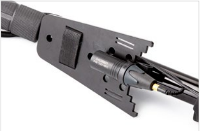
dpa microphones.com/ 4097-interview-kit